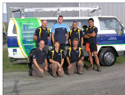
The Property Solutions team: a handsome bunch.

With a combined knowledge base spanning almost 30 years—yes, the majority with Grant there is not much that they don't know about plants, irrigation, pergolas, decks and all those general landscaping needs. With an enthusiastic and reliable team behind them you can count on "Team, PS".